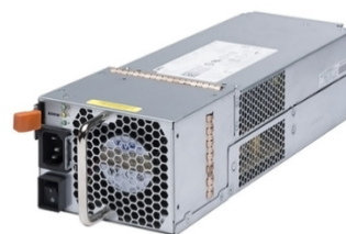
Server Power Supply